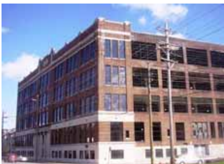
Phenix development for Preservation of American Standard

To review the list of Preservation Award winners since 1977, scroll down the following pages: