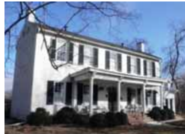
Bashford Bed & Breakfast / Bray House