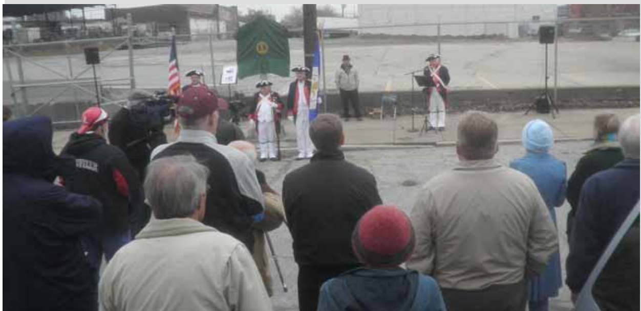
Below: The ceremony was very nicely coordinated and a good crowd attended.